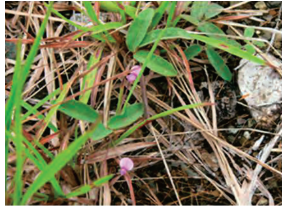
Photo 2. Glycine tomentella found in Dogura