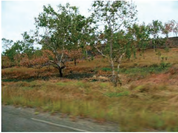
Photo 1. Dry grassland with eucalyptus trees near Port Moresby, a habitat of Vigna radiata var. sublobata