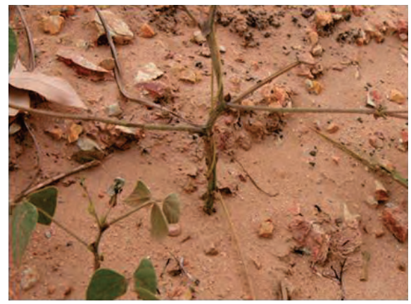
Photo 4. Vigna radiata var. sublobata , growing under serious drought condition