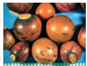
Photo 6. Morphological variation of the seeds of winged bean ( Psophocarpus tetragonolobus )