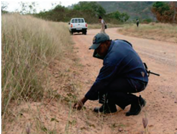
Photo 3. Dry habitat of Vigna radiata var. sublobata