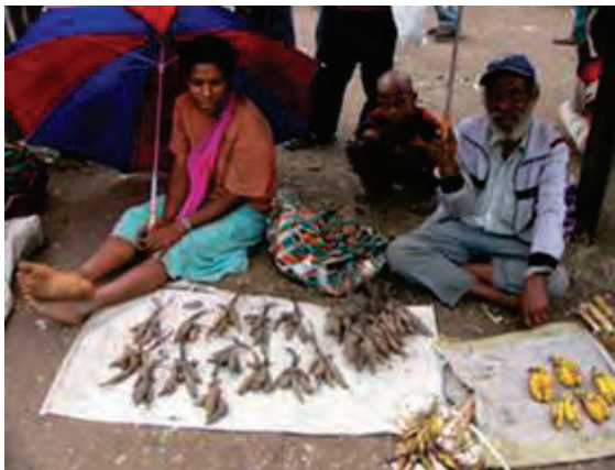
Photo 5. Winged bean ( Psophocarpus tetragonolobus ) sold in a highland market (left) and its cooked tuberous roots (right)