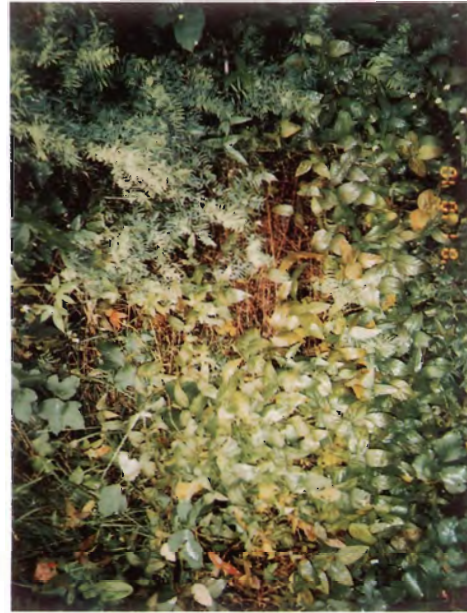
Glycine soja , Vicia cracca and Vigna angularis var. nipponensis growing together in an abandoned terrace at site 4.