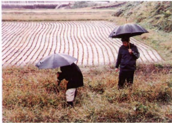
Vigna angularis var. nipponensis growing beside a harvested paddy field at site 12.