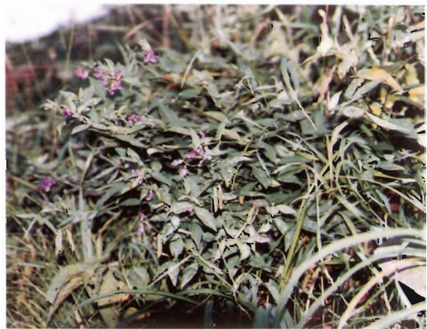
Vicia unijuga growing in a field terrace at site 15.