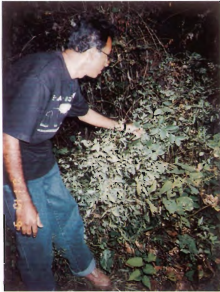
Vigna nipponica at site 1 growing beside a forest track in the shade.