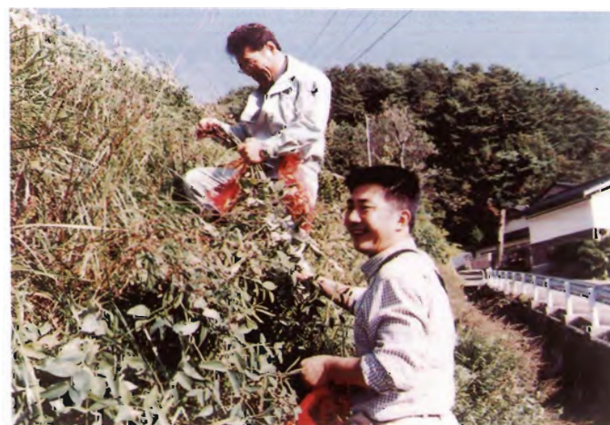
Vicia nipponica growing in a field terrace at site 15.