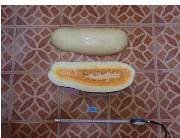
Sample Photo 17. MYC-24 ( Cucumis sativus )