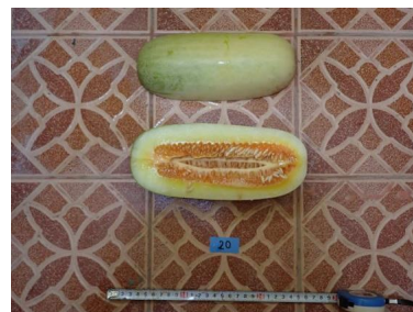
Sample Photo 15. MYC-21 ( Cucumis sativus )