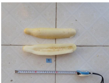
Sample Photo 4. MYC-9 ( Cucumis sativus )