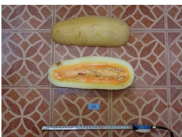
Sample Photo 16. MYC-22 ( Cucumis sativus )