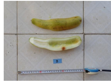
Sample Photo 3. MYC-8 ( Cucumis sativus )