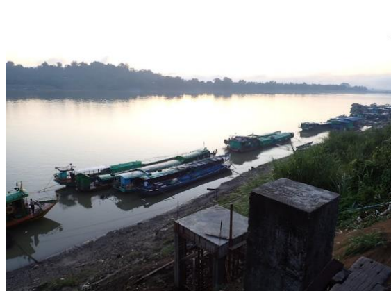
Photo 2. The main transportation method is by boat between Khamti and Hta Man Thi along the Chindwin River.

Khamti is the principal township in the Khamti district in the Sagaing region, along the Chindwin River (Photo 2). It is a warm area, where the average annual maximum temperature is approximately 30 °C. There is a relatively large market in the township, namely the Khamti market, where many species of crops are sold as local food sources, including Cucurbitaceae vegetables (Photo 3). We collected the seeds of pumpkin and ridge gourd (MYC-1 and 2, respectively), which were sown from September to November, and harvested from December to February. In the area around the Khamti township, farmers can cultivate crops throughout the year owing to the area’s warm weather conditions.