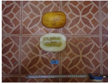
Sample Photo 14. MYC-20 ( Cucumis sativus )