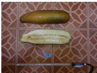
Sample Photo 13. MYC-19 ( Cucumis sativus )