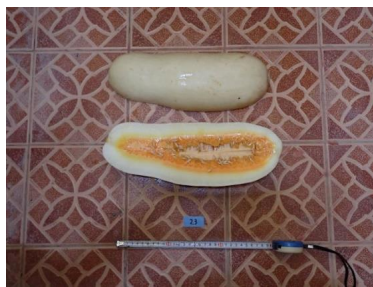
Sample Photo 17. MYC-24 ( Cucumis sativus )