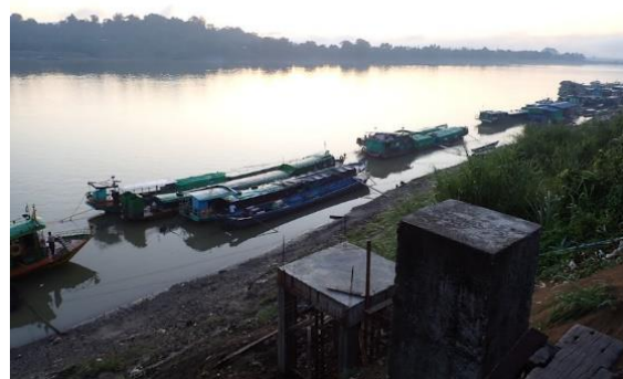
Photo 2. The main transportation method is by boat between Khamti and Hta Man Thi along the Chindwin River.

Khamti is the principal township in the Khamti district in the Sagaing region, along the Chindwin River (Photo 2). It is a warm area, where the average annual maximum temperature is approximately 30 °C. There is a relatively large market in the township, namely the Khamti market, where many species of crops are sold as local food sources, including Cucurbitaceae vegetables (Photo 3). We collected the seeds of pumpkin and ridge gourd (MYC-1 and 2, respectively), which were sown from September to November, and harvested from December to February. In the area around the Khamti township, farmers can cultivate crops throughout the year owing to the area’s warm weather conditions.