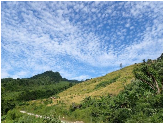
Photo 4. Slash-and-burn cultivation fields in Lahe township, where upland rice was cultivated; banana (that might be wild) was grown nearby.