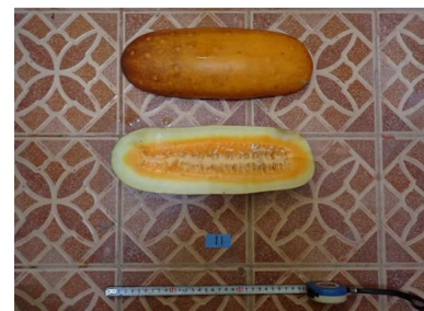
Sample Photo 6. MYC-11 ( Cucumis sativus )