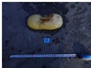
Sample Photo 5. MYC-10 ( Cucumis sativus )