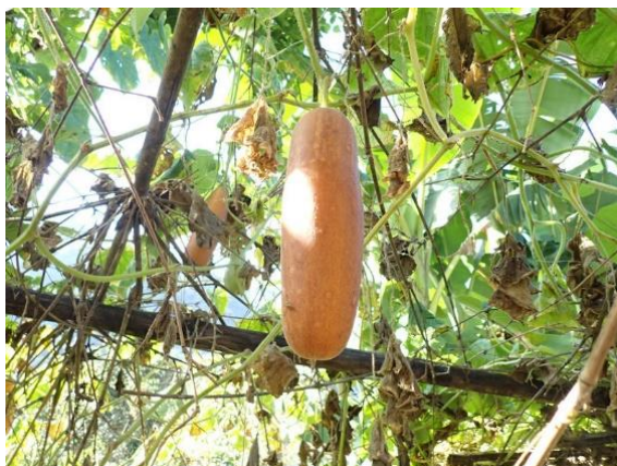
Photo 10. Farmers cultivated cucumber in their farmland using trellis. A mature fruit was used for stir-frying with other ingredient and obtaining seeds of the next generation.