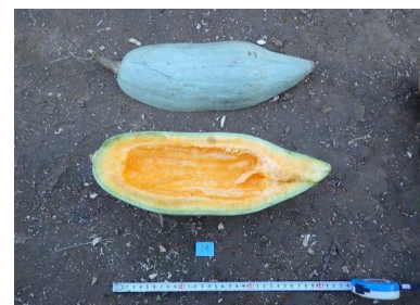
Sample Photo 9. MYC-14 ( Cucurbita moschata )