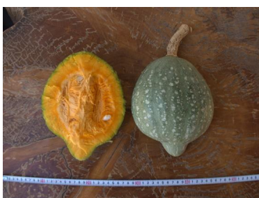
Sample Photo 10. MYC-15 ( Cucurbita maxima )