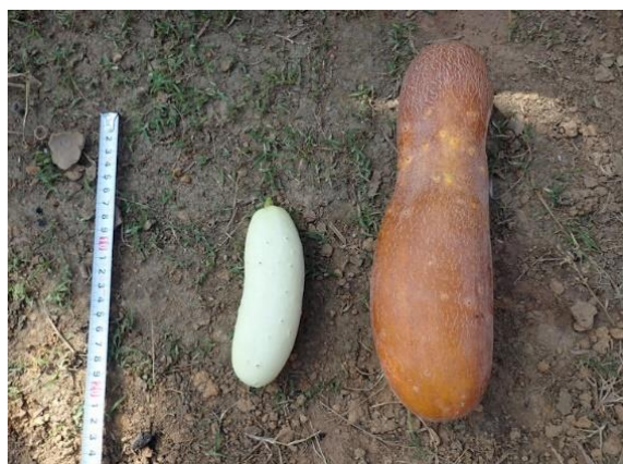
Photo 11. An immature fruit of cucumber with white skin color (left) becomes brown as the fruit matures (right).