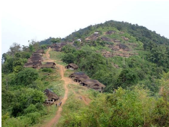
Photo 5. A distant view of San ton village located on a slope approximately 1,300 m above sea level.