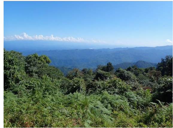
Photo 1. Landscape of a forest in the Sagaing region

The Sagaing region, located in northwestern Myanmar, is a hilly and mountainous area (Photo 1).