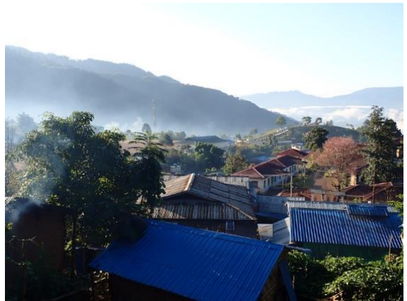
Photo 8. View of Lahe township. Its elevation is approximately 1,000 m above sea level.