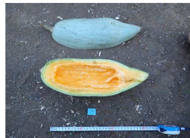
Sample Photo 9. MYC-14 ( Cucurbita moschata )