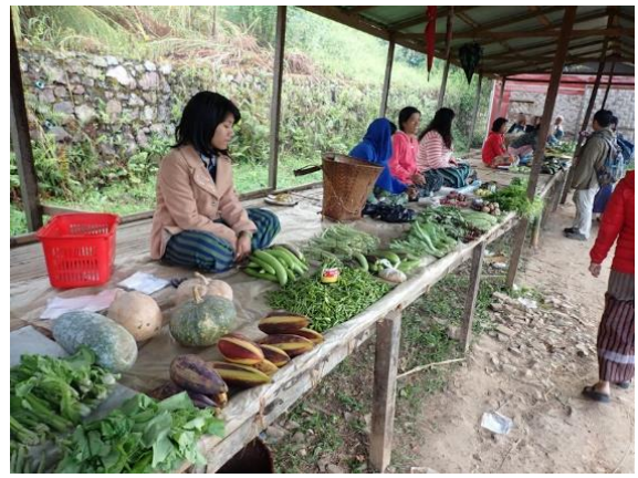
Photo 7. Vegetables displayed at a local marketplace in Lahe township