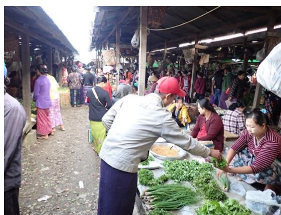
Photo 3. A variety of vegetables being displayed at a large local market, namely the Khamti market.

Lahe is another one of the principal townships in the Khamti district. The town and surrounding villages are inhabited by ethnic people, who follow their own cultures, traditions, and languages. Lahe is located approximately 1,000 m above sea level, and we collected genetic resources from one village that is over 1,300 m