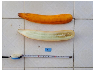
Sample Photo 2. MYC-5 ( Cucumis sativus )