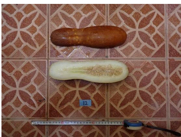
Sample Photo 7. MYC-12 ( Cucumis sativus )