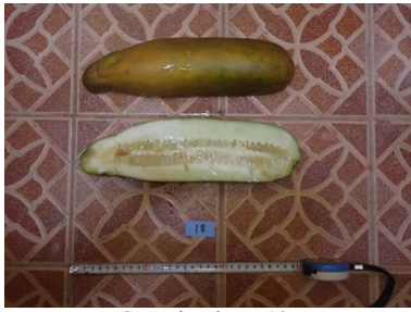
Sample Photo 13. MYC-19 ( Cucumis sativus )