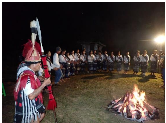
Photo 9. A traditional festival of Naga tribe being held in Layshi township.

Layshi is located in the forestry highland at approximately 1,300 m above sea level. The villages in this township are also inhabited by ethnic groups, mostly of the Naga tribes (Photo 9). We obtained cucumber and pumpkin samples that were collected from the Tung Kun Naga, Para Naga, and Makuri Naga tribes in this area. The Naga tribes practice different religions, e.g., Christianity or Buddhism, depending on each tribe, and they maintain their own cultures, traditions, and languages. Somra town and Kong Kai Lon Ywa Ma