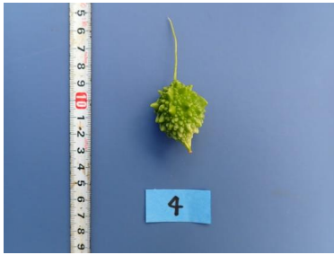
Sample Photo 1. MYC-4 ( Momordica charantia )