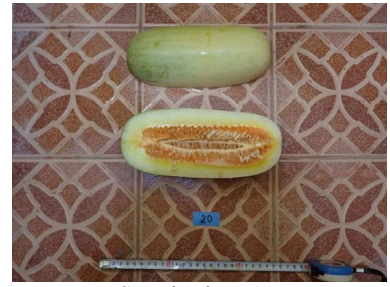
Sample Photo 15. MYC-21 ( Cucumis sativus )