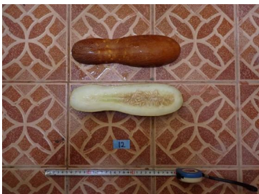
Sample Photo 7. MYC-12 ( Cucumis sativus )