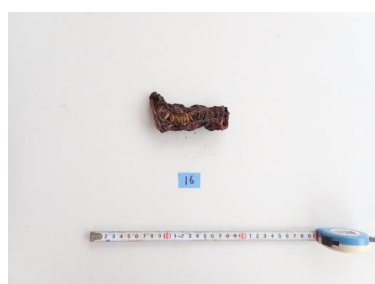
Sample Photo 11. MYC-16 ( Cucumis sativus )