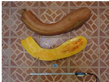
Sample Photo 8. MYC-13 ( Cucurbita moschata )