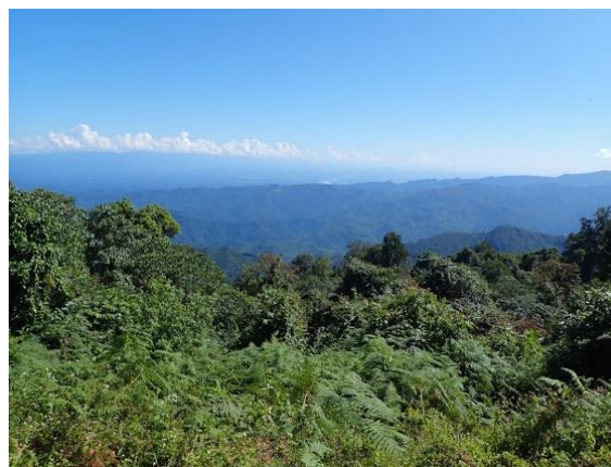
Photo 1. Landscape of a forest in the Sagaing region

The Sagaing region, located in northwestern Myanmar, is a hilly and mountainous area (Photo 1).