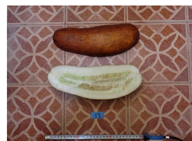
Sample Photo 12. MYC-17 ( Cucumis sativus )