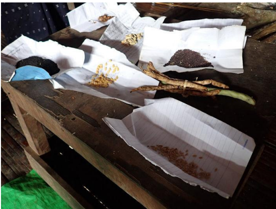
Photo 6. Various crop seeds received from the village mayor in San ton