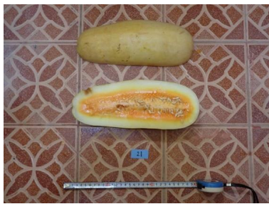
Sample Photo 16. MYC-22 ( Cucumis sativus )