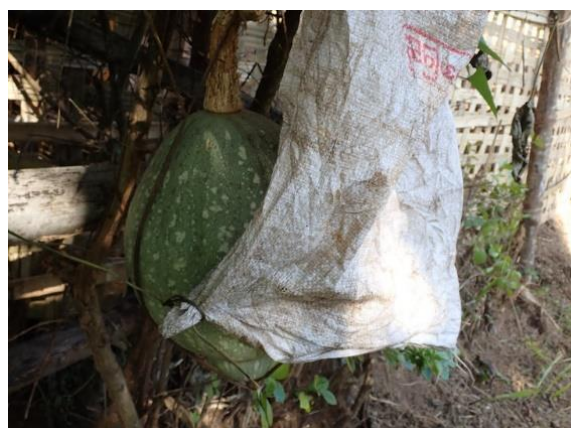
Photo 12. A farmer cultivating C. maxima , taking care of the fruits to prevent physical damage.

Myanmar Seed Bank and subsets were transferred to the Genetic Resources Center, NARO.