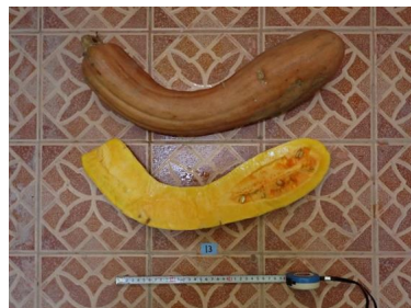
Sample Photo 8. MYC-13 ( Cucurbita moschata )