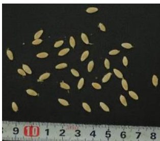
Sample Photo 52. A52. Cucumis melo