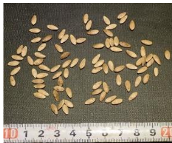
Sample Photo 62. A62. Cucumis melo