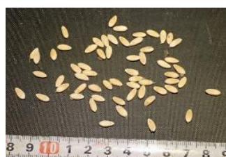
Sample Photo 67. A67. Cucumis melo