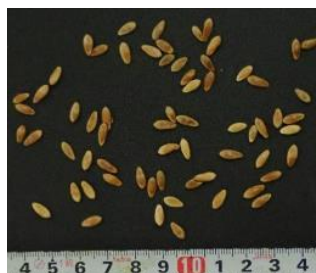
Sample Photo 47. A47. Cucumis melo