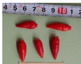
Sample Photo 11. A11. Capsicum frutescens