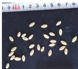
Sample Photo 41. A41. Cucumis melo