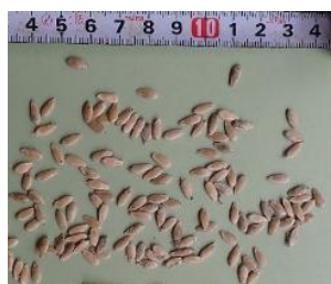
Sample Photo 10. A10. Cucumis melo