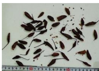
Sample Photo 55. A55. Capsicum frutescens