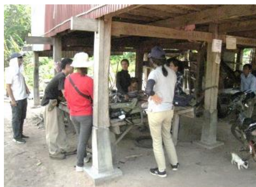
Photo 4. Interviewing local people in Kratie Province.

lanatus ), 7 chili peppers ( Capsicum frutescens ), and 1 eggplant ( Solanum melongena ) (Tables 2 and 3, Photos of collected samples). The collection sites are shown in Fig. 1. All samples of melon and cucumber were seeds, and all samples of watermelon, chili pepper and eggplant were fruits when they were collected (Table 3). Fifteen and fourteen samples of pumpkin were seeds and fruits, respectively. Five samples of cucumber were mixed with melon seeds, and one sample of cucumber was mixed with melon and pumpkin seeds after collection. Therefore, we separated them into each species (Photo 5). The seeds of each accession were divided into two,