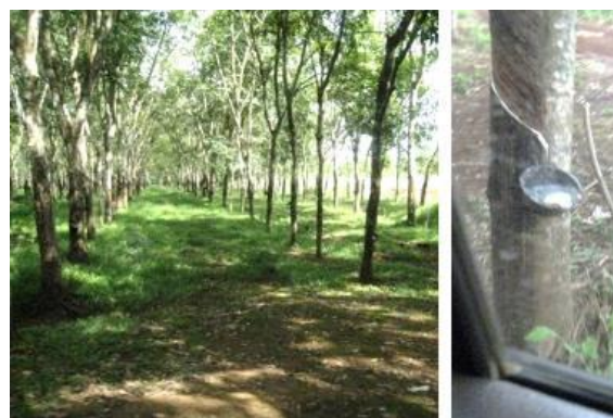
Photo 3. Rubber plantation in Mondul Kiri Province.