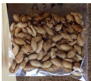
Sample Photo 34. A34. Cucurbita moschata