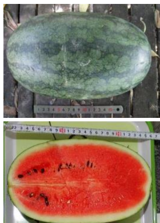
Sample Photo 1. A01. Citrullus lanatus