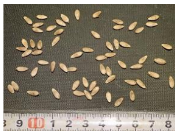
Sample Photo 61. A61. Cucumis melo