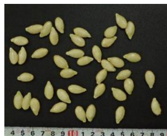
Sample Photo 51. A51. Cucurbita moschata