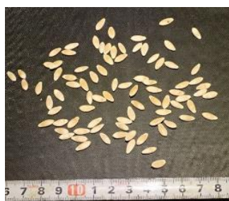
Sample Photo 70. A70. Cucumis melo