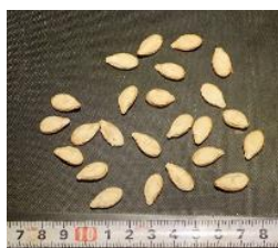
Sample Photo 59. A59. Cucurbita moschata