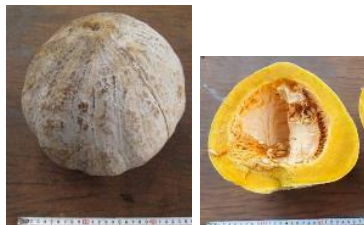
Sample Photo 16. A16. Cucurbita moschata