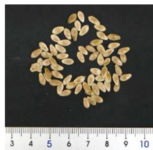
Sample Photo 35. A35. Cucumis melo