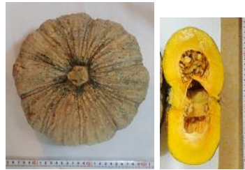
Sample Photo 14. A14. Cucurbita moschata