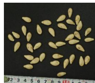
Sample Photo 48. A48. Cucurbita moschata