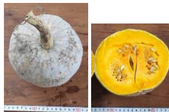
Sample Photo 17. A17. Cucurbita moschata