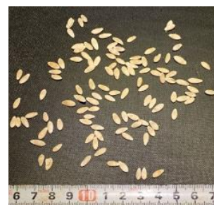
Sample Photo 69. A69. Cucumis melo