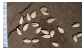
Sample Photo 9. A09. Cucurbita moschata