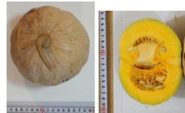
Sample Photo 15. A15. Cucurbita moschata