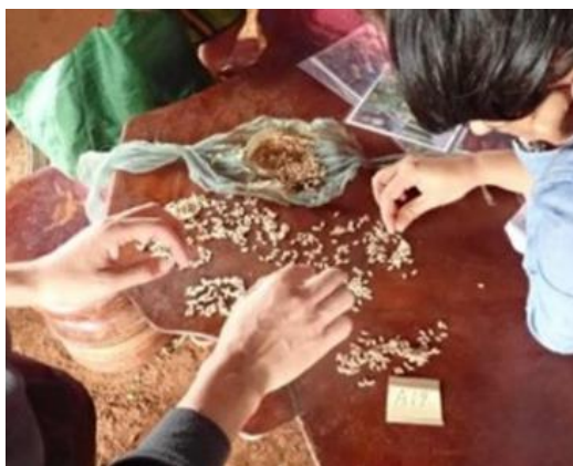
Photo 5. Separating mixed seeds of melon and cucumber.

A17, A37, and A56; elongated for No. A53; pyriform for Nos. A06 and A29; or triangular for No. A16. Most farmers do not use any fertilizers or chemicals, but one farmer said that both fertilizers and insecticides were used for pumpkin cultivation (No. A04, A05, and A06). The farmers cultivated pumpkins for selling. Many farmers sow pumpkin seeds in May and harvest fruits from July to October (Remarks in Table 3).