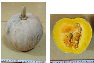
Sample Photo 37. A37. Cucurbita moschata