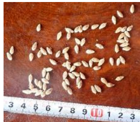
Sample Photo 19. A19. Cucumis melo