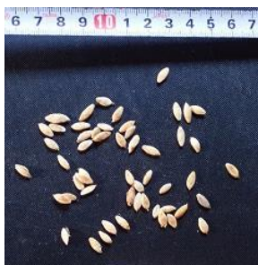
Sample Photo 22. A22. Cucumis sativus