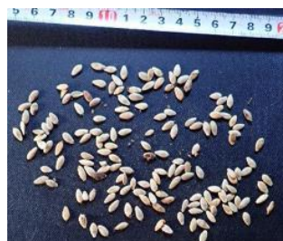
Sample Photo 23. A23. Cucumis melo