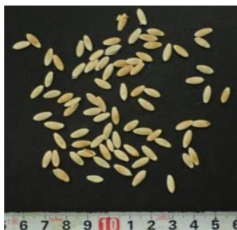
Sample Photo 50. A50. Cucumis melo