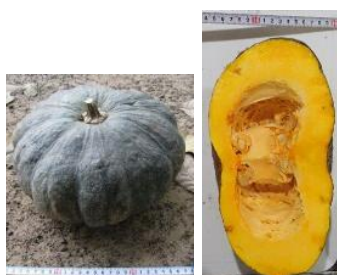
Sample Photo 4. A04. Cucurbita moschata