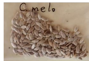
Sample Photo 33. A33. Cucumis melo