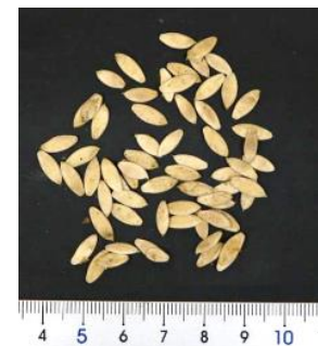
Sample Photo 30. A30. Cucumis sativus