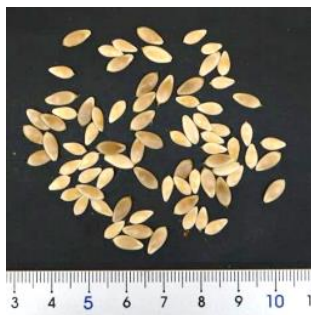
Sample Photo 31. A31. Cucumis melo