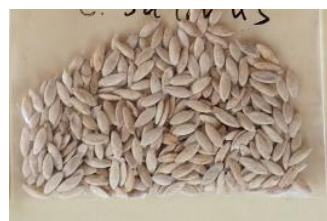
Sample Photo 32. A32. Cucumis sativus