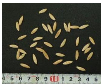
Sample Photo 40. A40. Cucumis sativus