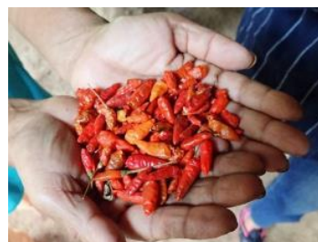
Sample Photo 3. A03. Capsicum frutescens