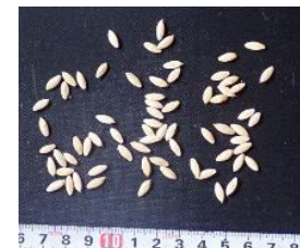
Sample Photo 21. A21. Cucumis sativus