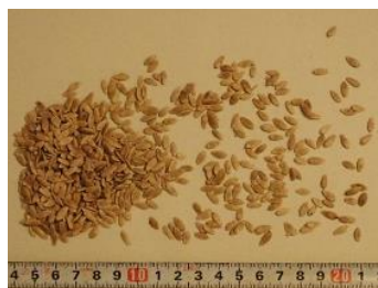
Sample Photo 2. A02. Cucumis melo