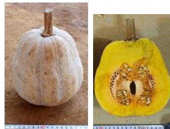
Sample Photo 29. A29. Cucurbita moschata