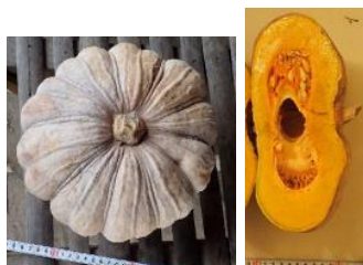
Sample Photo 64. A64. Cucurbita moschata