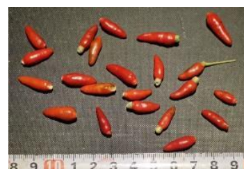
Sample Photo 66. A66. Capsicum frutescens