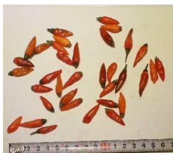
Sample Photo 65. A65. Capsicum frutescens