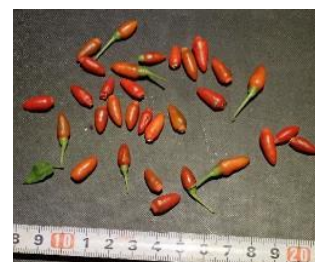
Sample Photo 72. A72. Capsicum frutescens