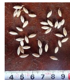
Sample Photo 18. A18. Cucumis sativus