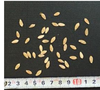
Sample Photo 27. A27. Cucumis melo