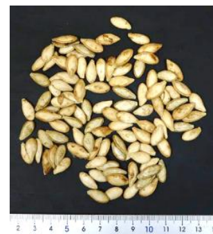
Sample Photo 45. A45. Cucurbita moschata