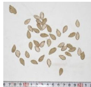
Sample Photo 54. A54. Cucurbita moschata