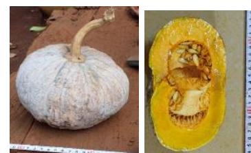
Sample Photo 36. A36. Cucurbita moschata