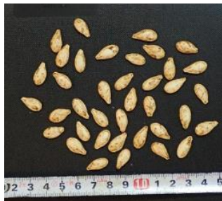
Sample Photo 28. A28. Cucurbita moschata