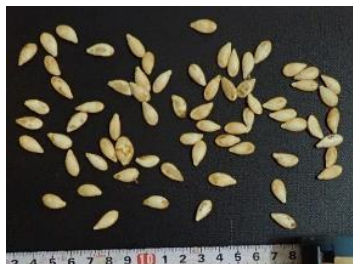
Sample Photo 38. A38. Cucurbita moschata