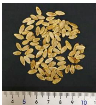
Sample Photo 46. A46. Cucumis melo