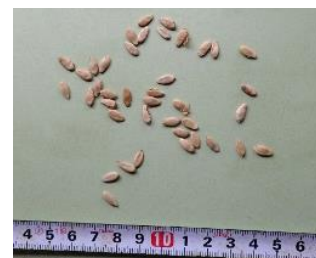
Sample Photo 12. A12. Cucumis melo