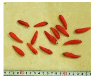
Sample Photo 57. A57. Capsicum frutescens