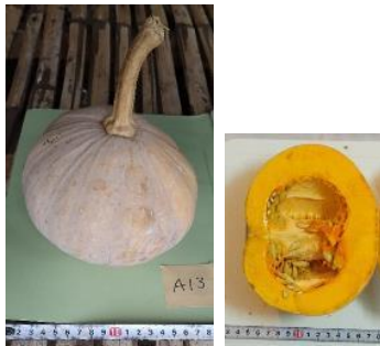
Sample Photo 13. A13. Cucurbita moschata