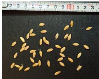
Sample Photo 25. A25. Cucumis melo