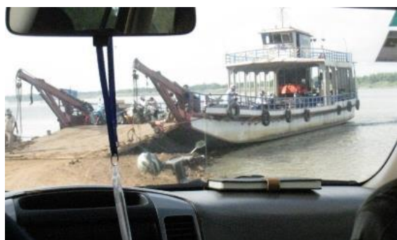
Photo 2. We loaded our car onto a ship and crossed the Mekong River in Kratie Province.