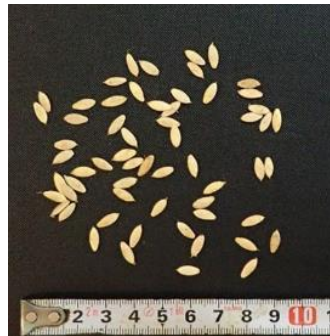
Sample Photo 26. A26. Cucumis sativus