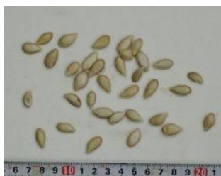
Sample Photo 58. A58. Cucurbita moschata