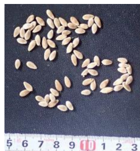
Sample Photo 20. A20. Cucumis melo