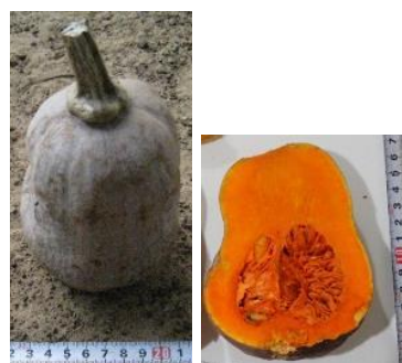
Sample Photo 6. A06. Cucurbita moschata