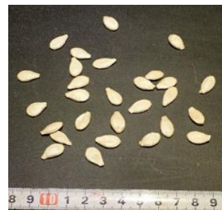
Sample Photo 63. A63. Cucurbita moschata