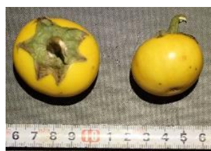
Sample Photo 68. A68. Solanum melongena