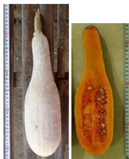
Sample Photo 53. A53. Cucurbita moschata