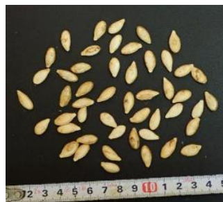
Sample Photo 44. A44. Cucurbita moschata