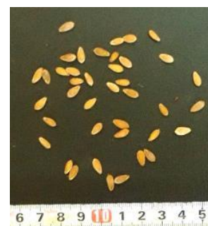
Sample Photo 42. A42. Cucumis melo