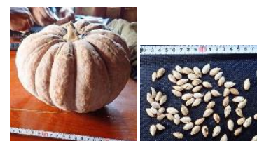
Sample Photo 24. A24. Cucurbita moschata