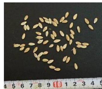
Sample Photo 39. A39. Cucumis melo