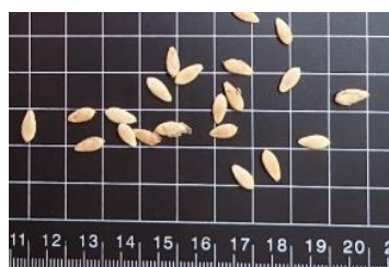
Sample Photo 8. A08. Cucumis melo