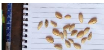
Sample Photo 7. A07. Cucurbita moschata