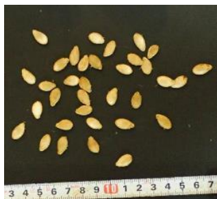
Sample Photo 43. A43. Cucumis melo