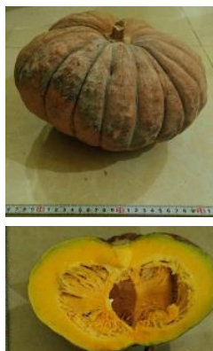
Sample Photo 49. A49. Cucurbita moschata