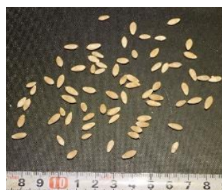
Sample Photo 71. A71. Cucumis melo