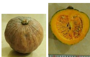
Sample Photo 56. A56. Cucurbita moschata