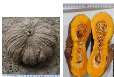
Sample Photo 5. A05. Cucurbita moschata