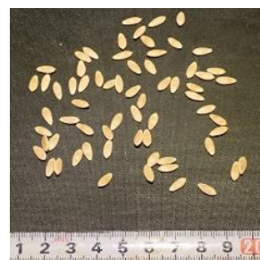
Sample Photo 60. A60. Cucumis melo