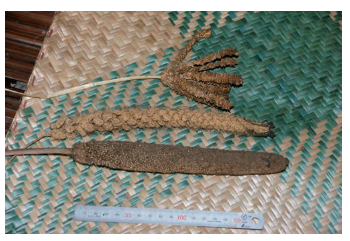
and pearl millet (lower) were traditional cereals in Kachin state of Myanmar. They could face extinction due to urbanization and socio-economic changes occurring there.