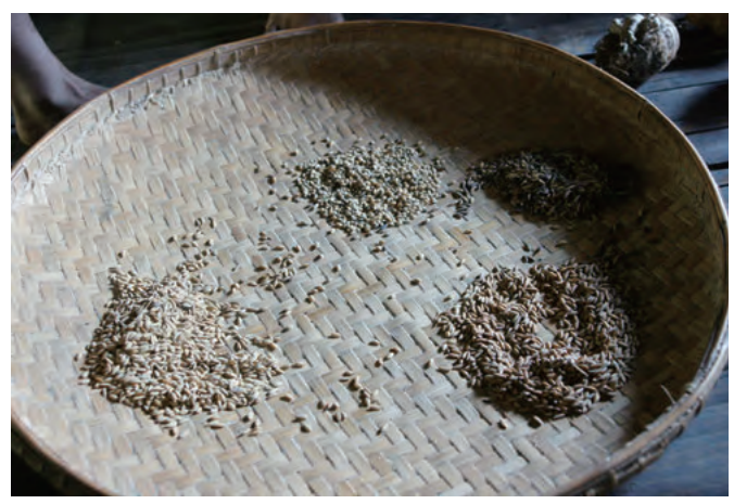
Photo 3. Finger millet (upper), foxtail millet (middle) Photo 4. It was commonly observed that there were several traditional rice varieties grown in a village, which were clearly distinguished from each other by locals.