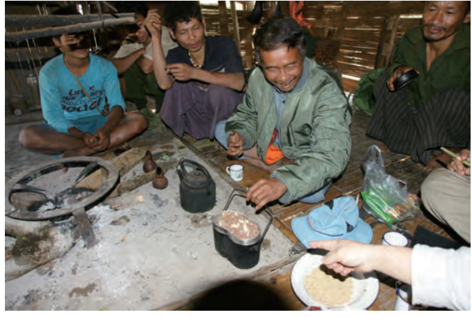
Photo 1. Local people kindly provided their crop varieties and related information.