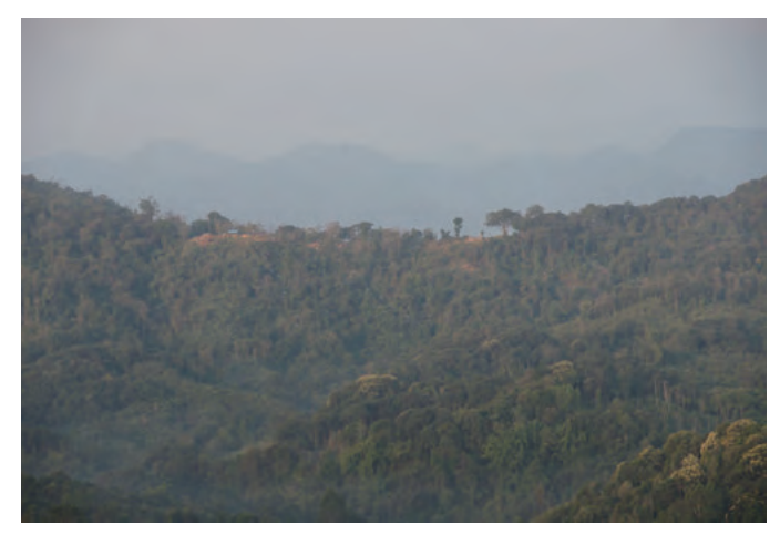
Photo 5. Remote villages were sometimes located near the tops or ridges of the mountains and their Taung-ya fields were reclaimed on the adjacent slopes below the villages.