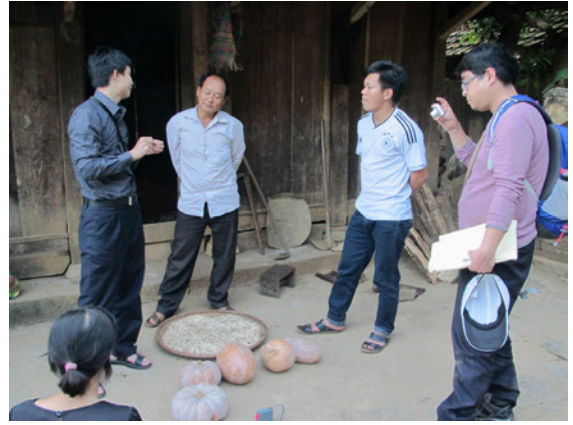
Photo 2. Interviewing local people at Phien Pi B village, Tuan Gia