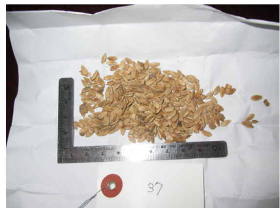
Photo 16. No. 37 melon seeds at Ba Ho village, Muong Khuong