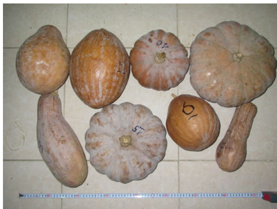
Photo 7. Collected pumpkin fruits