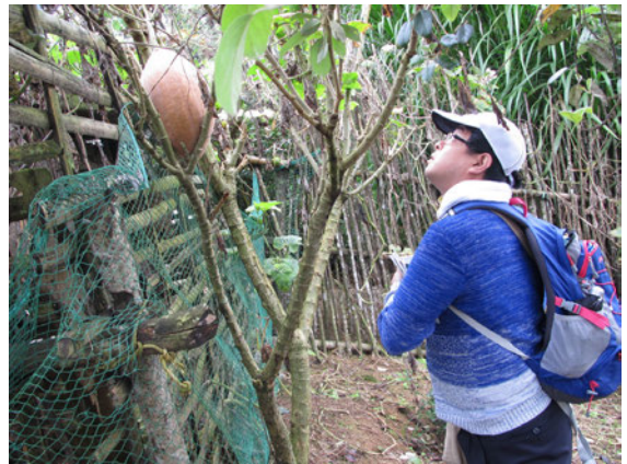
Photo 6. Pumpkin fruit cultivated at farmer's garden, Tuan Giao