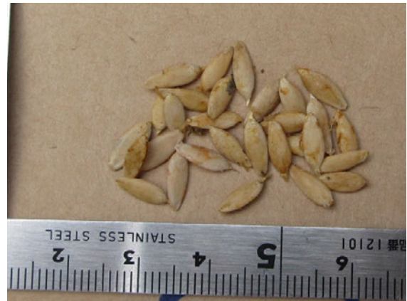
Photo 12. No. 26 cucumber seeds at Hua Tat village, Son La