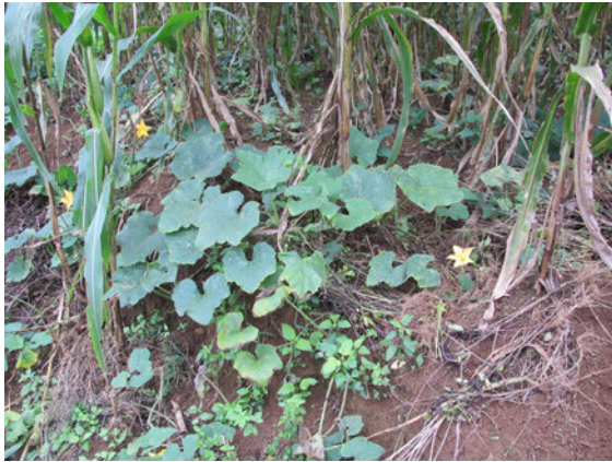
Photo 9. Pumpkin cultivated with maize in Xong Lan village, Quan Ba