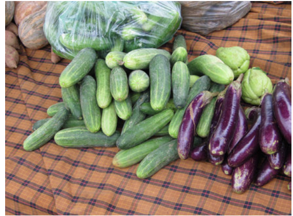
Photo 10. Cucumber fruits of commercial cultivar at Cao Son town, Cao Phong