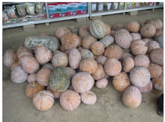
Photo 8. Pumpkin fruits at Hua Tat village, Son La