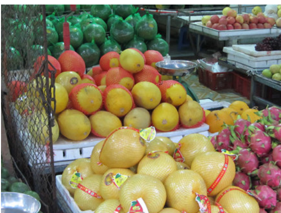
Photo 15. Melon fruits from China at Lao Cai town, Lao Cai