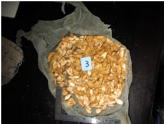
Photo 5. No. 3 pumpkin seeds at Chop ly village, Dien Bien Dong