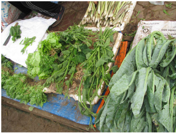
Photo 3. Pumpkin shoots at Cao Son town, Cao Phong