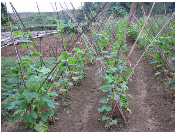
Photo 13. Cucumber cultivation field, Lao Cai