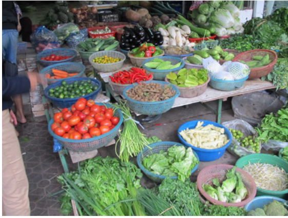
Photo 1. Market at Lao Cai town