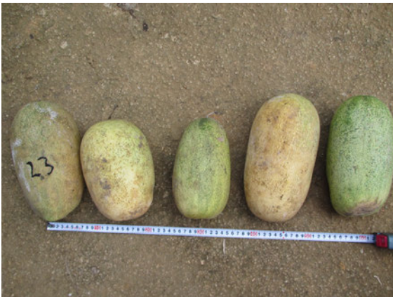
Photo 11. Collected cucumber fruits at Coma village, Thuan Chau