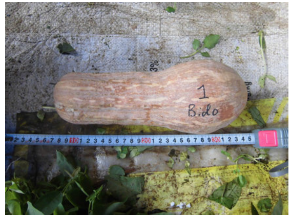
Photo 4. No. 1 pumpkin fruits at Cao Son town, Cao Phong