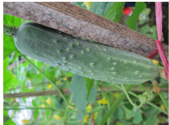
Photo 14. South Chinese type cucumber, Lao Cai