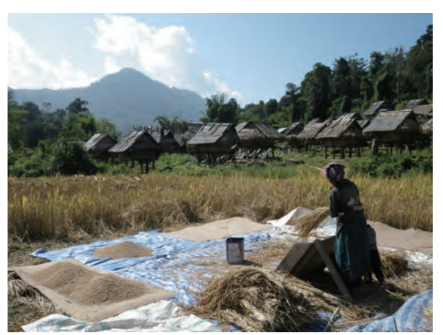
Photo 3. A farmer beating a rice bundle for threshing in the terraced field at NAM LUANG village (WP164). The traditional warehouses in the background of the photo have pillars with rat-guards supporting the raised floors and are used for grain storage.