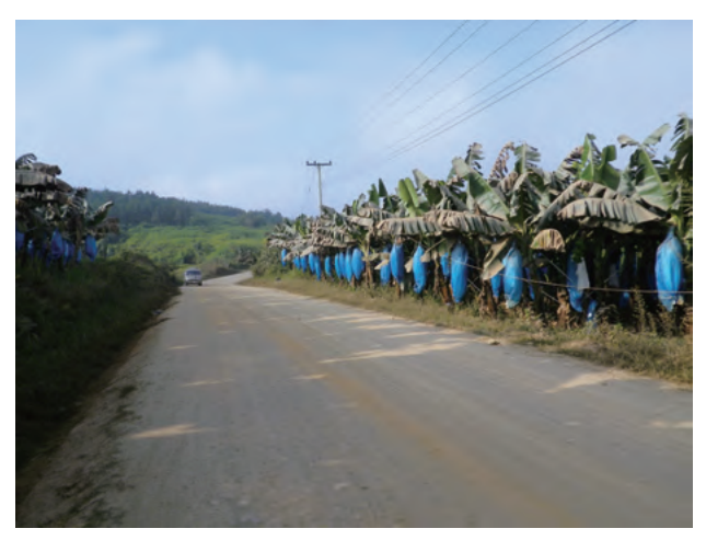
Photo 1. Banana plantations were established at northern areas of Lao PDR. Banana plants were densely grown with a pipe irrigation system and their bunches are encased in plastic bags for protection.