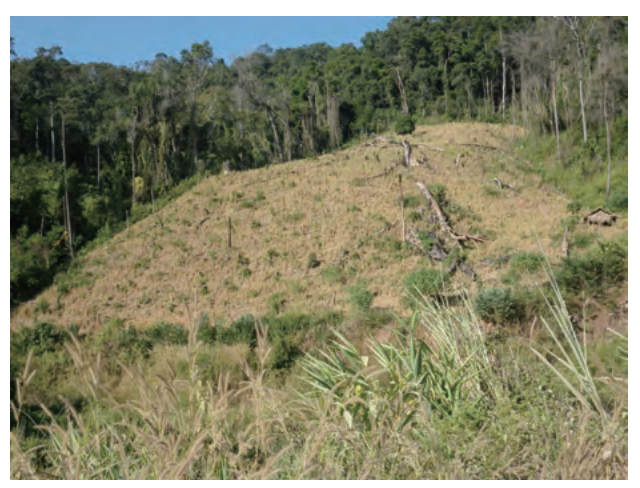
Photo 2. Rice is the staple diet in Lao PDR. This photo shows a traditional slash-and-burn cultivation field on a hill slope in Bokeo Province.