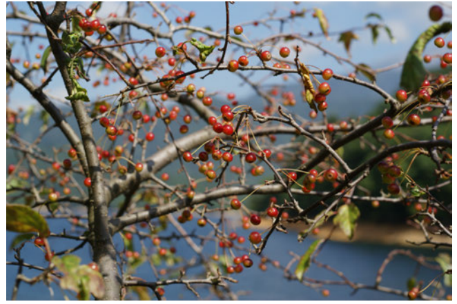
Photo 2. Infructescence of Malus toringo . Arimine, Toyama-shi, Toyama Pref.