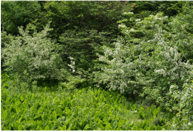
Photo 1. An indigenous habitat of Malus toringo . Yokodani Moor, Komatsu-shi, Ishikawa Pref.