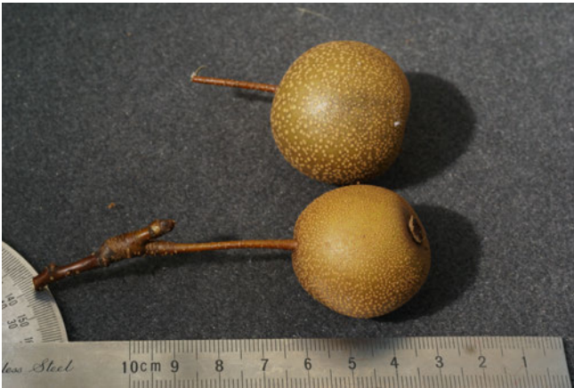
Photo 3. Fruits of Pyrus pyrifolia . Inamura, Kamiichi-machi, Toyama Pref.