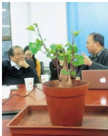
The Chinese variety Xushu 18 was selected for the genome sequencing project.

Meanwhile sweetpotato genome sequencing of the Chinese variety Xushu 18 was performed by Illumina and PacBio platforms. PacBio reads with a total length of 181.5Gb were assembled into 9,179 primary contigs and 8,806 haplotigs by FALCON unzip. The total length of the primary contigs was 1.8Gb (N50 = 325.5Mb), and that of the haplotigs was 336kb (N50 = 44.9kb). Pseudomolecules are under development based on an SNP linkage map consisting of 28,087 SNPs mapped across 96 linkage groups. The genome sequencing of sweetpotato is expected to be published in 2018.