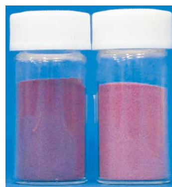
Photo 1. Drum-dried powder made of Kyushu 166 (left) and Churakoibeni (right)