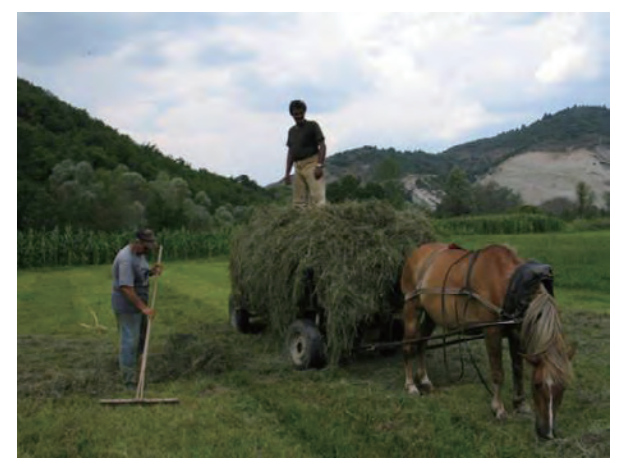
Photo 5. Harvesting the hay on a meadow in the Rodopi mountain area.