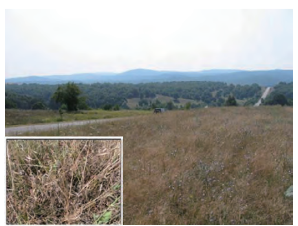
Photo 2. Pasture of the site No. 0629 near Debovech in the East Rodopi mountain area ( T. spp.).