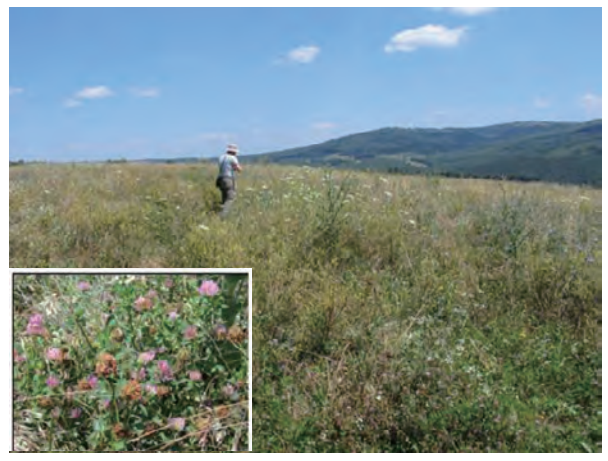
Photo 1. Pasture of the site No. 0601 near Gorno Pavlikene in the Balkan mountain area (Flowering of T. pratense ).