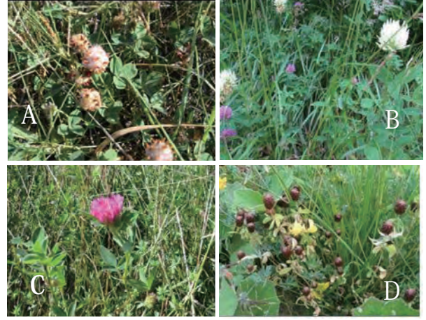
Photo 4. Diversity of genus Trifolium in Bulgaria (A: T. fragiferum , B: T. pannonicum , C: T. medium , D: T. aureum ).