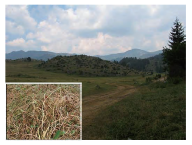
Photo 3. Pasture of the site No.0652 near Yogodina in the West Rodopi mountain area ( T. michelianum ).