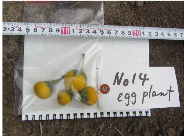
Photo 10. No. 14 eggplant fruits in Mlah village, Phu Can commune, Krong Pa district