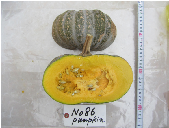
Photo 7. A cut squash fruit of No. 86 in Hlang village, Hnol commune, Dak Doa district