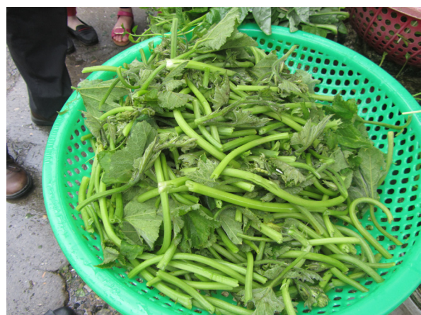
Photo 6. Young shoots and leaves of squash ( Cucurbita moschata ) purchased at Ron market, Pleiku City