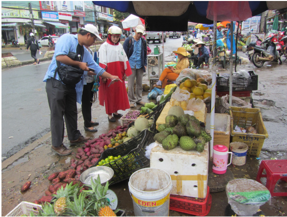
Photo 1. Ron Market in Pleiku City