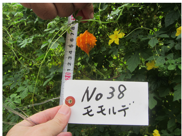
Photo 12. A mature fruit and flowers of No. 38 bitter melon in Group 8 village, Phu Tuc town, Krong Pa district