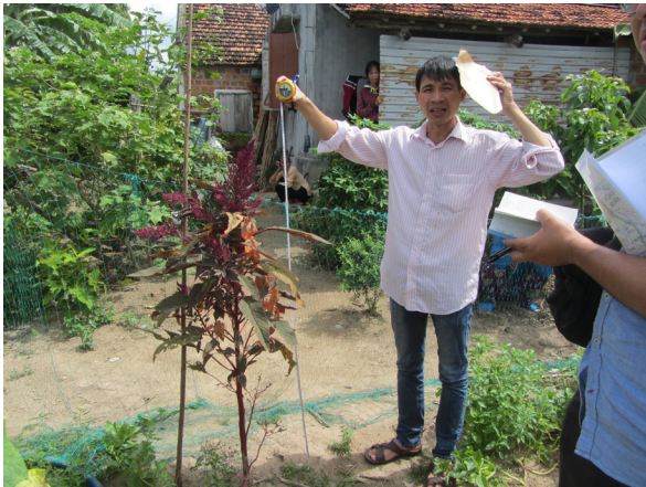
Photo 3. No. 7 amaranths plant in Dong Hung village, Phu Can commune, Krong Pa district