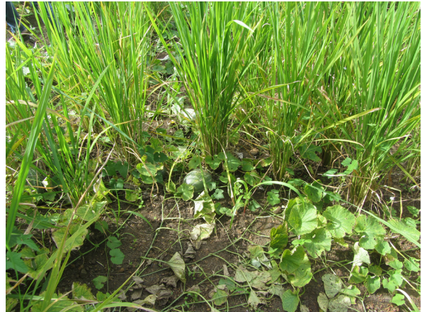
Photo 8. Squash plants cultivated with rice in Kon Mah Hor village, Ha Dong commune, Dak Doa district