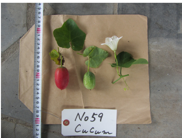
Photo 11. No.59 fruits assumed to be Coccinia sp. in Tnung 2 village, Ya Ma commune, Kong Chro district