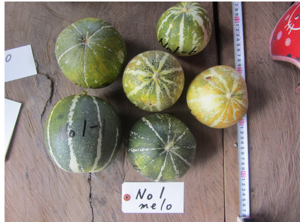
Photo 4. No. 1 melon fruits cultivated at a farmer's garden, Y village, Chu' Rcam commune, Krong Pa district