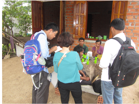
Photo 2. Interviewing local people in No. 13 village, la Mlah commune, Krong Pa district