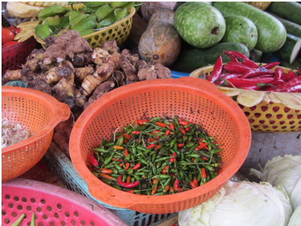
Photo 9. No. 2 chili pepper fruits purchased at Ron market, Pleiku City