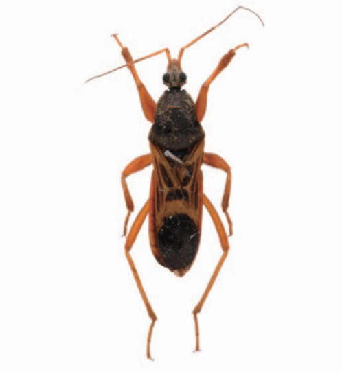
Fig. 7 Ectomocoris elegans (Fabricius, 1803) ヤエヤマサシガメ (22-0040104)