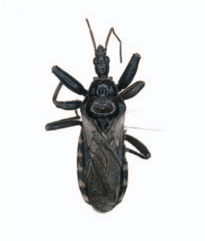
Fig. 5 Amphibolus venator (Klug, 1830) コメグラサシガメ (22-0021623)