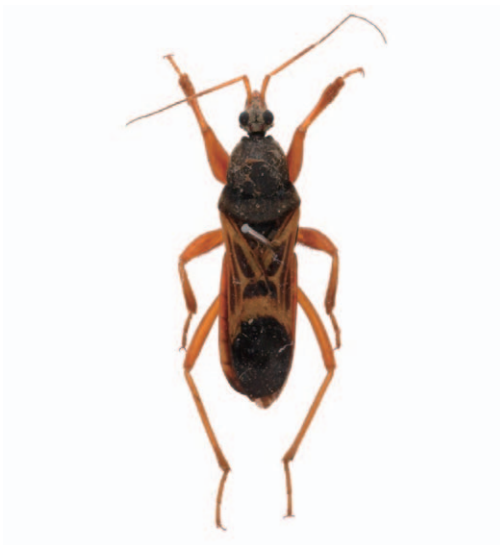
Fig. 7 Ectomocoris elegans (Fabricius, 1803) ヤエヤマサシガメ (22-0040104)