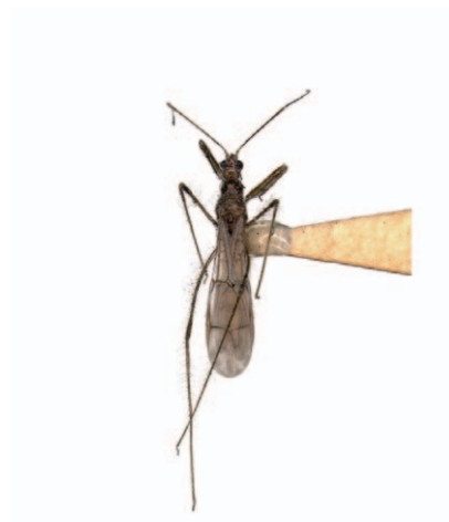
Fig. 4 Emesopsis nubila Uhler, 1894 ネッタイケブカカモドキサシガメ (22-0021617)