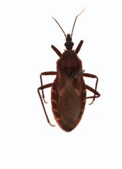
Fig. 10 Triatoma rubrofasciata (De Geer, 1773) オオサシガメ (22-0020768)