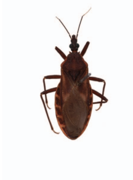
Fig. 10 Triatoma rubrofasciata (De Geer, 1773) オオサシガメ (22-0020768)