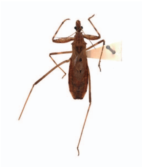
Fig. 9 Oncocephalus simillimus Reuter, 1888 タイリクトビロサシガメ (22-0021345)