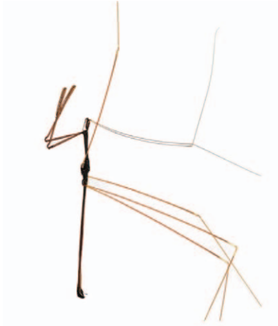
Fig. 1 Gardena melinarthrum Dohrn, 1860 オオアシナガサシガメ (22-0021643)