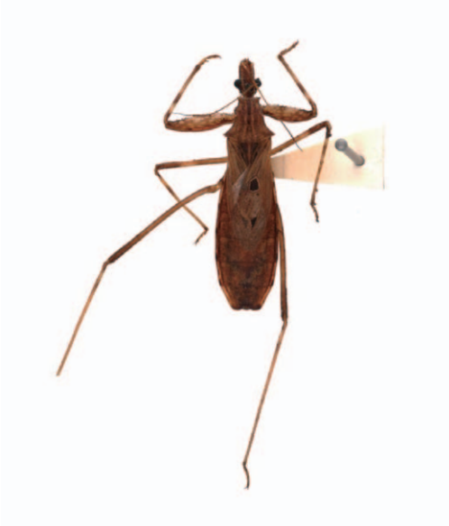
Fig. 9 Oncocephalus simillimus Reuter, 1888 タイリクトビロサシガメ (22-0021345)