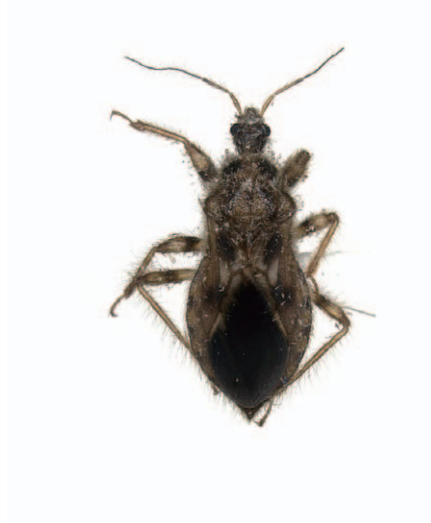
Fig. 8 Peregrinator biannulipes (Montrouzier et Signoret, 1861) ケブカサシガメ (22-0021635)