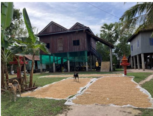
Photo 2. Drying harvested rice under the sun, common seen at the villages (Kampong Thom)