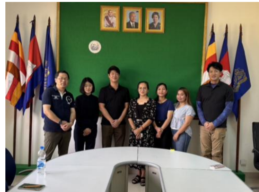
Photo 3. Group photo with the Deputy Director General (center) and travel members at the CARDI