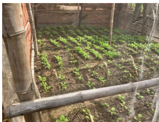
Photo 24. Leafy vegetable cultivation with plastic net for preventing pests (Prey Veng)

International Treaty on Plant Genetic Resources for Food and Agriculture (Table 3). We plan to multiply the obtained genetic resources and evaluate them during the following year.