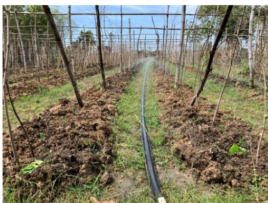
Photo 22. Cowpea cultivation with soil management and irrigation