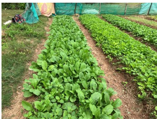
Photo 21. Cultivation of improved leafy vegetable variety (Kampong Chhnang)