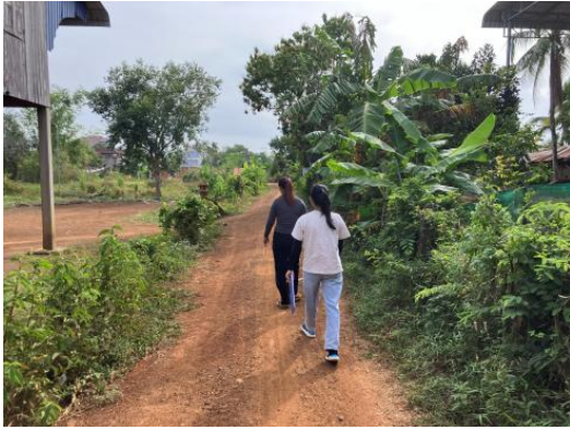
Photo 6. Reach farmers house by walking where car is unable to run (Kampong Cham)