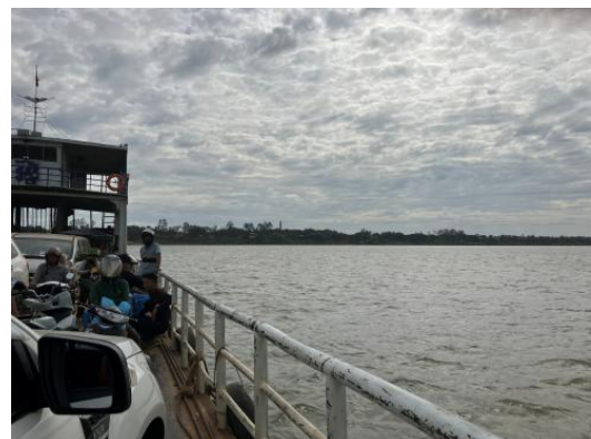
Photo 5. Across the river by boat to reach villages (Kampong Cham)

We visited the houses, backyards, and fields of farmers, roadsides, vegetable stands, and public markets by vehicle and on foot (Photos 6 - 11). The precise positions of sites where samples were collected were recorded using Garmin ForeTrex 401 (Garmin