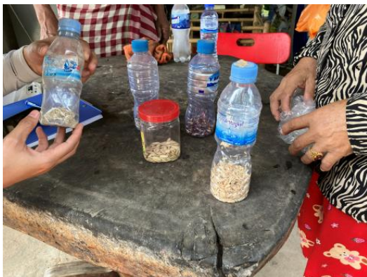
Photo 17. Seeds preserved in plastic PET bottle (JPs 292045–292047)

All seeds of the 108 samples collected were stored as genetic resources in the CARDI Genebank and divided into two subsets. One of the subsets was placed in the NARO Genebank with JP numbers under the Standard Material Transfer Agreement of the