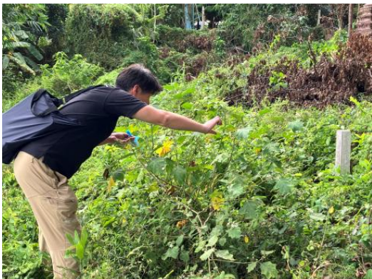
Photo 8. Collecting Turkey berry at the backyard (Kampong Chhnang)