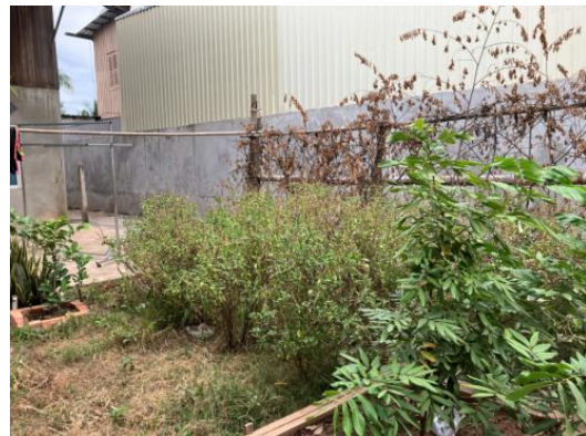
Photo 19. Vegetable cultivation for daily consumption at the backyard (JP291957)