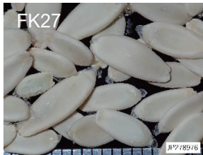
JP278976 (FK27), Cucumis sativus