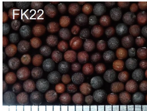
JP278972 (FK22), Brassica rapa ssp. oleifera