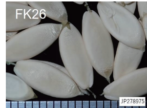
JP278975 (FK26), Cucumis sativus