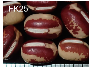
JP278974 (FK25), Vigna angularis