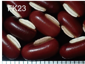
JP278974 (FK23), Vigna umbellata