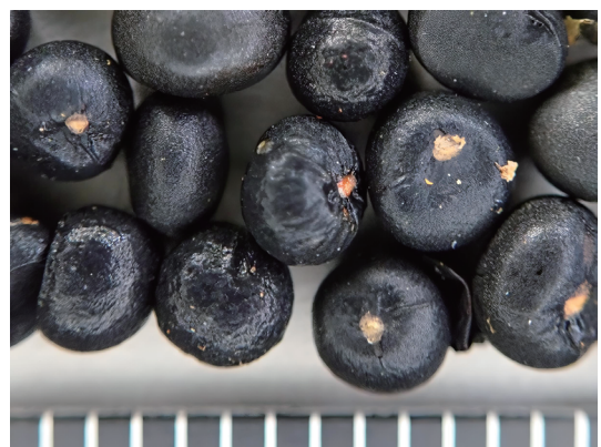
Fig. 8. Seeds of Asparagus kiusianus (FK01).