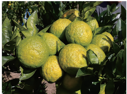
Fig. 30. Fruits of Citrus nobilis var. kunep (FK31).