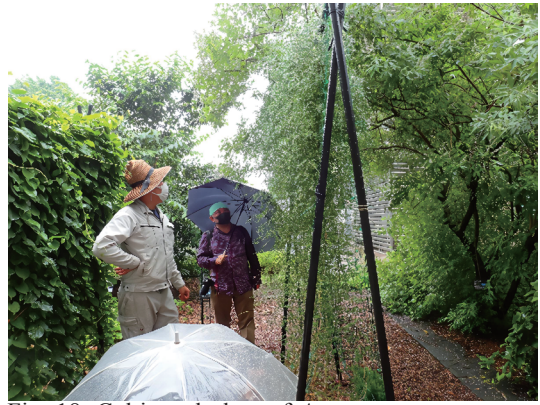
Fig. 18. Cultivated plant of Aparagus cochinchinensis (FK24).