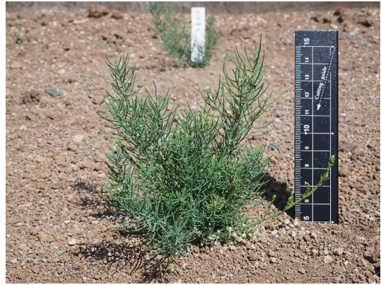
Fig. 10. Cultivated plant of Aparagus kiusianus in the NARO Genebank.