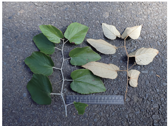
Fig. 22. Leaves of Vitis kiusiana (FK29).