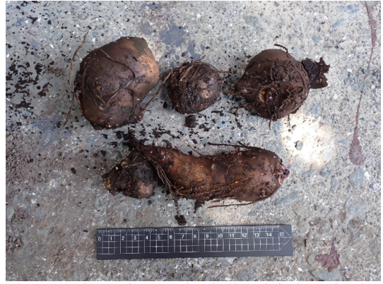
Fig. 34. Tubers of Amorphophallus rivieri var. konjac (FK35).