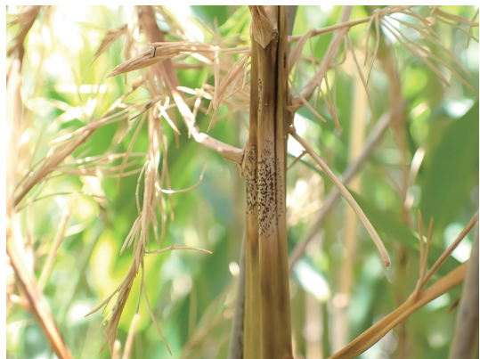
Fig. 14. Stems of Asparagus oligoclonos showing disease symptoms.