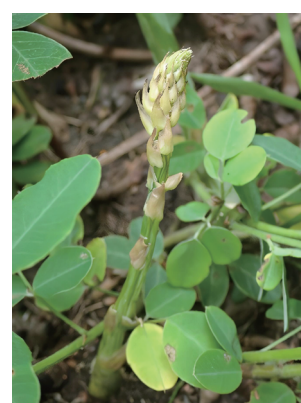
Fig. 16. Shoot of Asparagus oligoclonos .