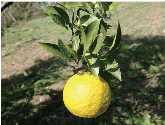
Fig. 29. Fruits of Citrus nobilis var. kunep (FK31).