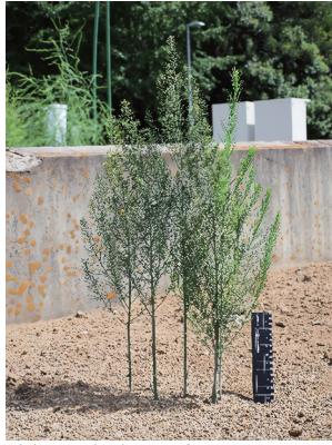
Fig. 17. Cultivated plant of Aparagus oligoclonos in the NARO Genebank.