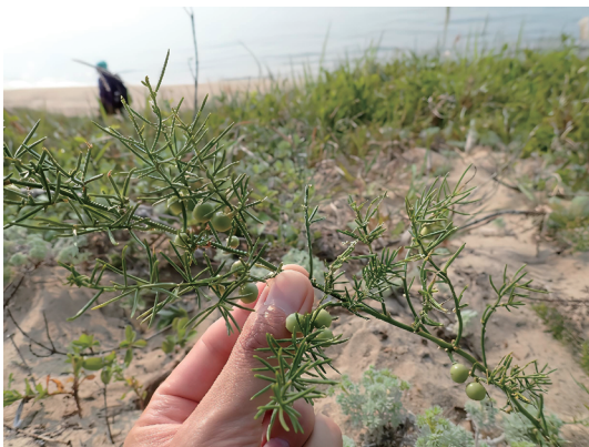
Fig. 5. Plants with immature fruits of Asparagus kiusianus (FK01).