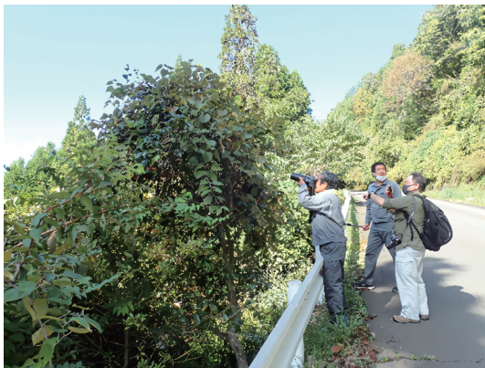
Fig. 21. Habitat of Vitis kiusiana (FK29).