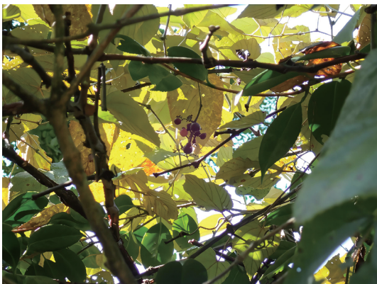
Fig. 23. Plant with mature fruits of Vitis kiusiana (FK29).