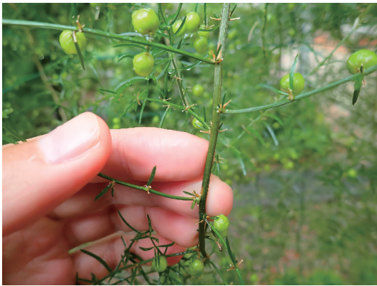
Fig. 19. Cultivated plants with immature fruits of Aparagus cochinchinensis (FK24).