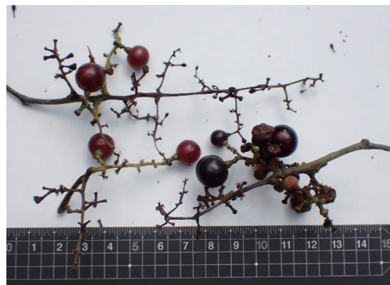
Fig. 24. Fruits of Vitis kiusiana (FK29).