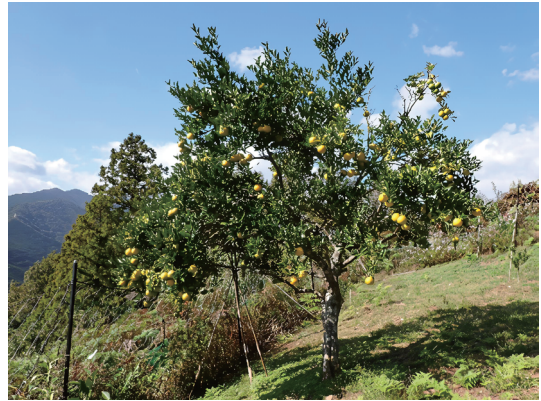
Fig. 28. Tree of Citrus nobilis var. kunep (FK31).