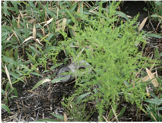
Fig. 1. Plant of Asparagus schoberioides .