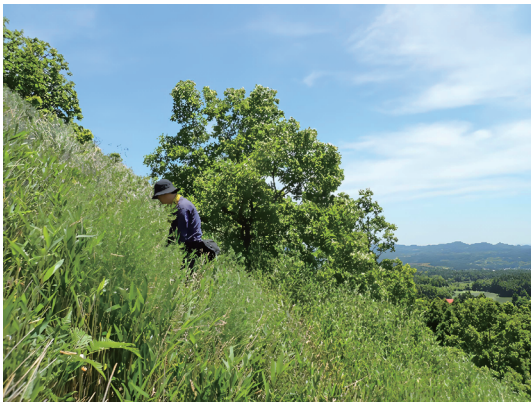
Fig. 11. Habitat of Aparagus oligoclonos .