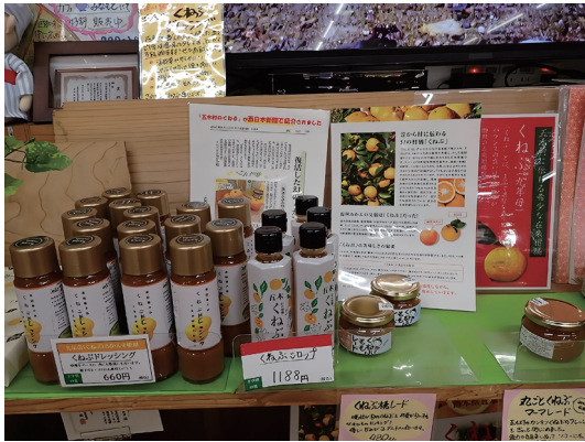
Fig. 27. Examples of "Kunebu" processed products.