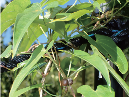
Fig. 33. Plant and bulbils of Dioscorea japonica (FK34).