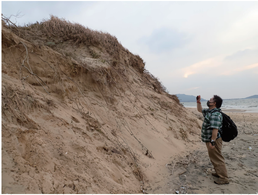
Fig. 9. Habitat of Aparagus kiusianus eroded by high tides.