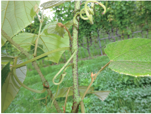
Fig. 25. Cultivated plant of Vitis kiusiana (JP251040).