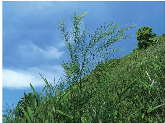
Fig. 12. Plant of Aparagus oligoclonos .