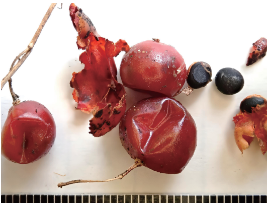
Fig. 13. Fruits and seeds of Aparagus oligoclonos .