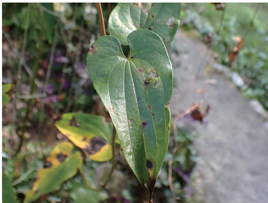
Fig. 31. Plant of Dioscorea japonica (FK33).