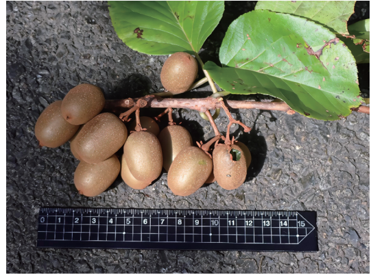
Fig. 26. Fruits of Actinidia rufa (FK30).