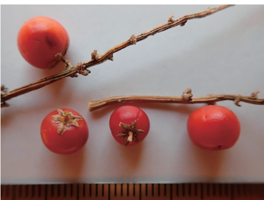
Fig. 7. Mature fruits of Asparagus kiusianus (FK01).