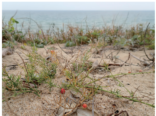
Fig. 6. Plants with mature fruits of Asparagus kiusianus (FK01).