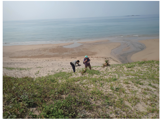
Fig. 2. Habitat of Asparagus kiusianus (FK01).