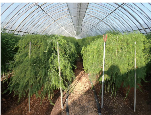
Fig. 15. Cultivation of asparagus in Minamiaso Village.