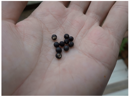
Fig. 20. Seeds of Aparagus cochinchinensis (FK24).