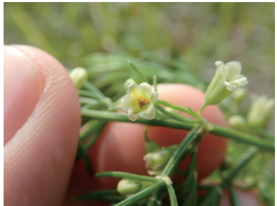
Fig. 4. Staminate flower of Asparagus kiusianus (FK01).