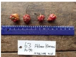
No. 61 Capsicum sp.