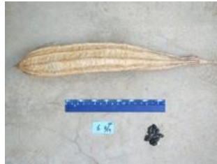
No. 6 Luffa acutangula