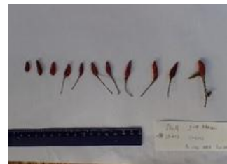
No. 16 Capsicum frutescens