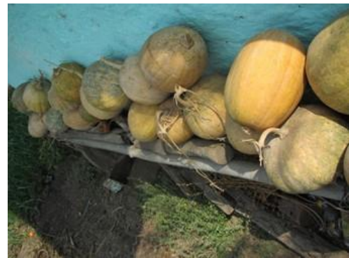
Photo 4. Fruits of Cucurbita moschata at Samdhin Ghunti, Panchthar District.