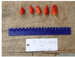
No. 40 Capsicum sp.