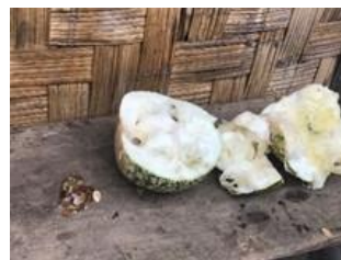
No. 65 Cucurbita ficifolia