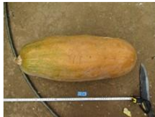
No. 11 Cucurbita moschata