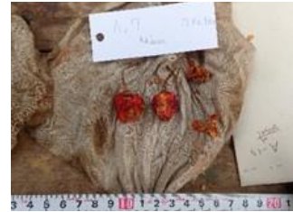
No. 7 Capsicum sp.