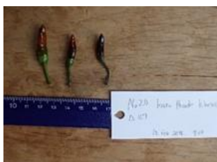
No. 20 Capsicum annum