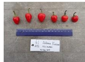
No. 59 Capsicum sp.