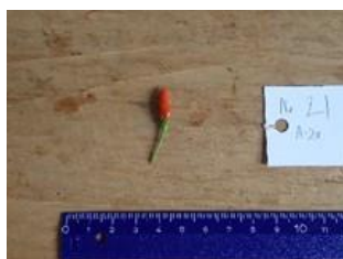
No. 21 Capsicum frutescens