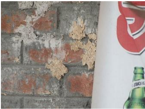
Photo 3. Cucumber seeds mixed with ash were stored on the wall at Thumke, Dhankuta District.