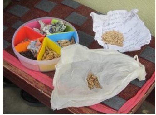
Photo 2. Seeds of Cucurbitaceae crops at Barbote, Ilam District.