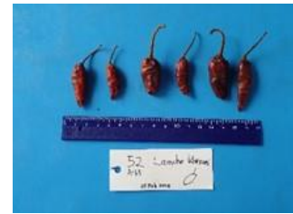
No. 50 Capsicum annuum