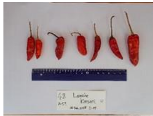
No. 46 Capsicum annuum