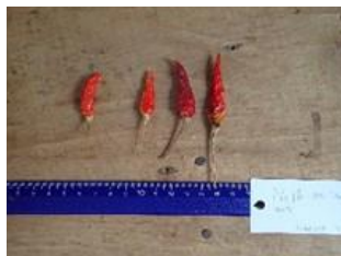
No. 18 Capsicum annum