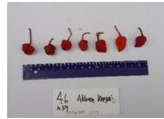
No. 44 Capsicum sp.