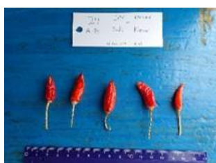
No. 26 Capsicum annum