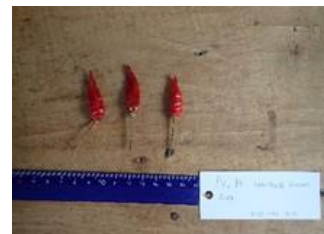
No. 19 Capsicum annum