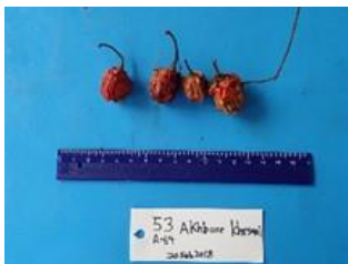
No. 51 Capsicum sp.