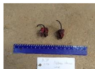
No. 36 Capsicum sp.