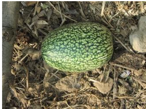
Photo 5. Fruits of Cucurbita ficifolia at Thumke, Dhankuta District.