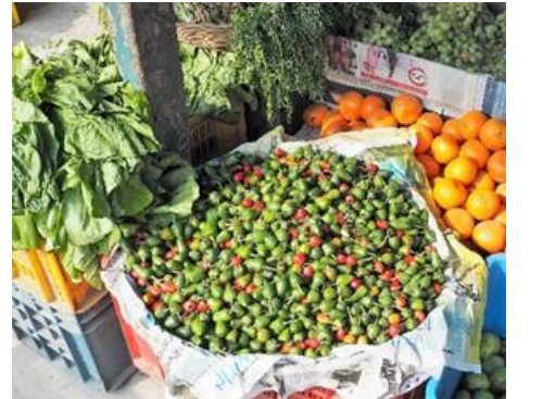
Photo 6. 'Akbare Khursani' sold in the vegetable market at Hile, Dhankute District.