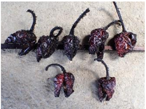
Photo 7. Dried and smoked fruits above a cooking stove to preserve their seeds, Namje village, Dhankuta District.