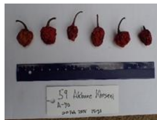
No. 57 Capsicum sp.