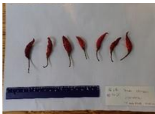
No. 14 Capsicum annum