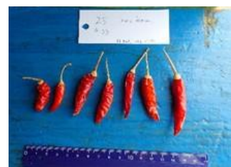
No. 24 Capsicum annum