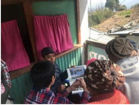
Photo 1. Interviewing local farmers at Sangurigari, Dhankuta District.