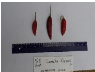
No. 56 Capsicum annuum