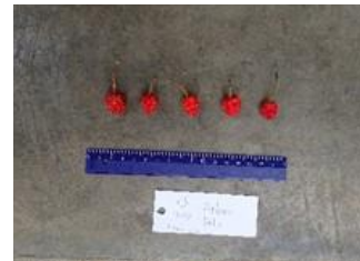
No. 13 Capsicum sp.