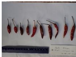
No. 15 Capsicum annum