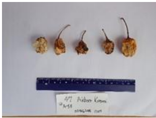
No. 45 Capsicum sp.