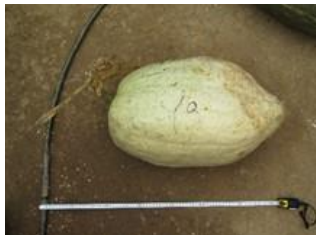
No. 10 Cucurbita maxima