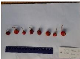
No. 17 Capsicum sp.