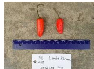
No. 54 Capsicum annuum