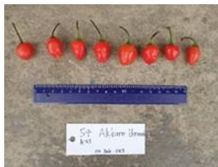
No. 52 Capsicum sp.