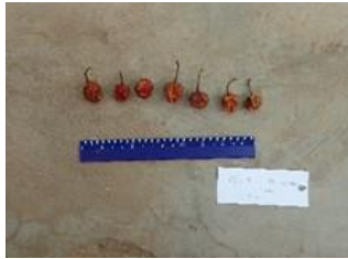
No. 4 Capsicum sp.