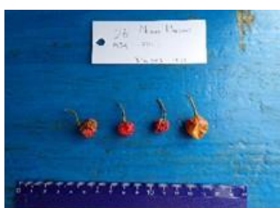
No. 25 Capsicum sp.