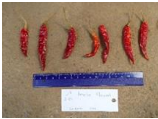
No. 37 Capsicum annuum