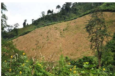
Photo 9. Huge slash-and-burn field in northern part of Laos (Phe Village, Laos)