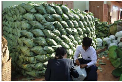
Photo 1. A large amount of cabbage at the accumulative market (Aungban, Myanmar)