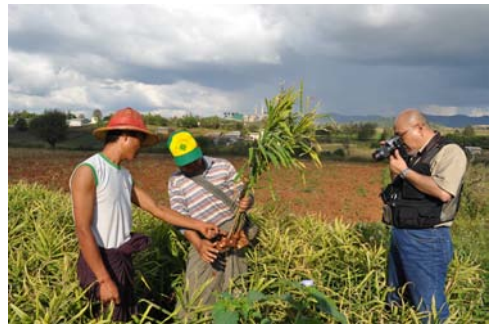
Photo 2. A farmer's field for mass production of ginger (Pet Ta Le Village, Myanmar)