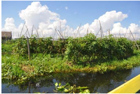
Photo 3. Tomato cultivation in a floating field (Inle Lake, Myanmar)