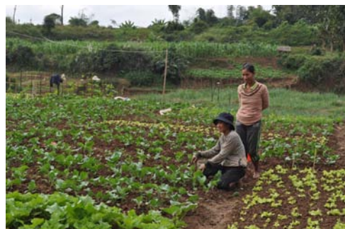
Photo 8. Cultivation of lettuce, cabbage and so on for the market in riverside farmland (Huay Hom Village, Laos)