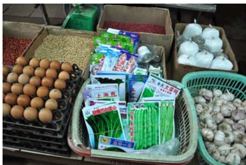
Photo 7. Seeds improved in China sold at a market (Oudomxay, Laos)