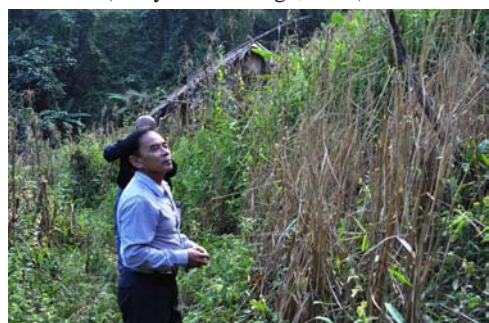
Photo 10. Tall upland rice observed in a slash-and-burn field (Moi Phe Village, Laos)