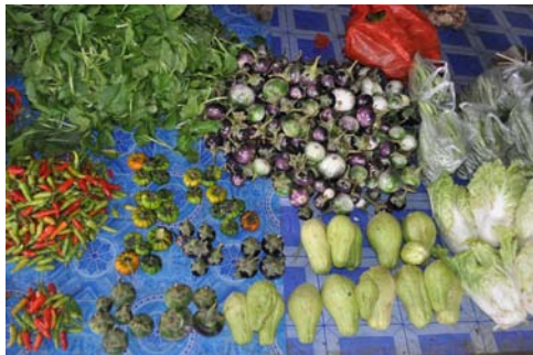
Photo 5. Eggplants considered as landraces in a market (Oudomxay, Laos)