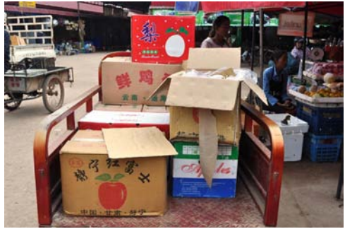
Photo 4. Pears and apples imported from China in a market (Oudomxay, Laos)