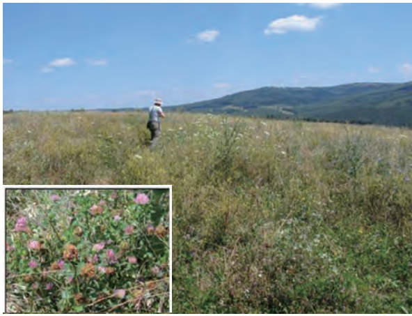
Photo 1. Pasture of the site No. 0601 near Gorno Pavlikene in the Balkan mountain area (Flowering of T. pratense ).