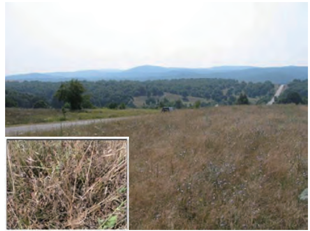
Photo 2. Pasture of the site No. 0629 near Debovech in the East Rodopi mountain area ( T. spp. ).