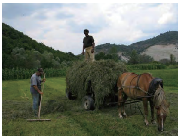
Photo 5. Harvesting the hay on a meadow in the Rodopi mountain area.