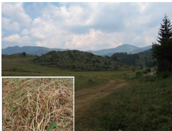
Photo 3. Pasture of the site No.0652 near Yogodina in the West Rodopi mountain area ( T. michelianum ).