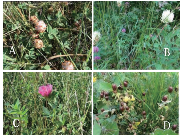
Photo 4. Diversity of genus Trifolium in Bulgaria (A: T. fragiferum , B: T. pannonicum , C: T. medium , D: T. aureum ).